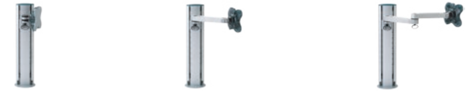
• EGL-200 • EGL-300 W124xD147xH461mm • EGL-201 • EGL-301 W124xD317xH461mm • EGL-202 • EGL-302 W124xD487xH461mm