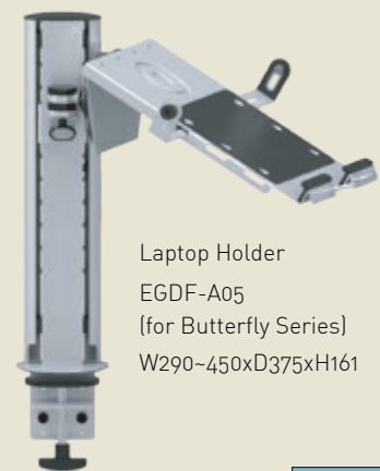
Laptop Holder EGDF-A05 (for Butterfly Series) W290-450xD375xH161

The series of Multi-monitors offer the convenience of various usages. It also provides comfortable, ergonomics vision and complete cable management. It save the space and most suitable for stock market and securities.