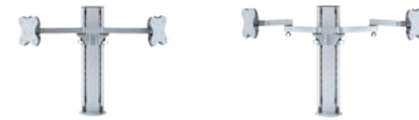
• EGL-201D • EGL-301D W561xD159xH461mm • EGL-202D • EGL-302D W901xD159xH461mm