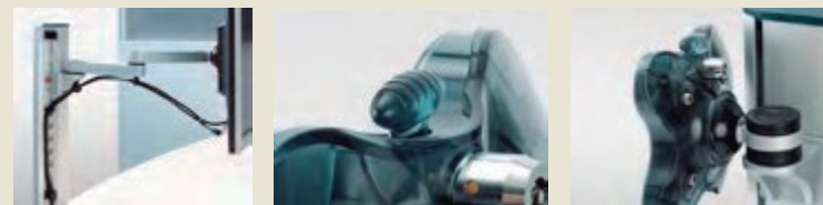
Cable management Quick release Anti-theft kit