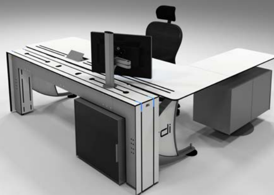
KOMPAS CONSOLE SUPERVISOR INDIVIDUAL CONFIGURATION